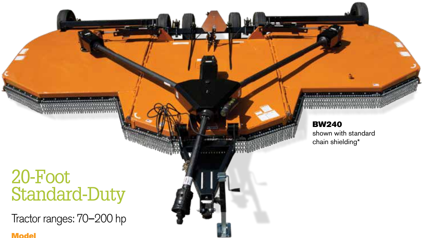
BW240 shown with standard chain shielding*