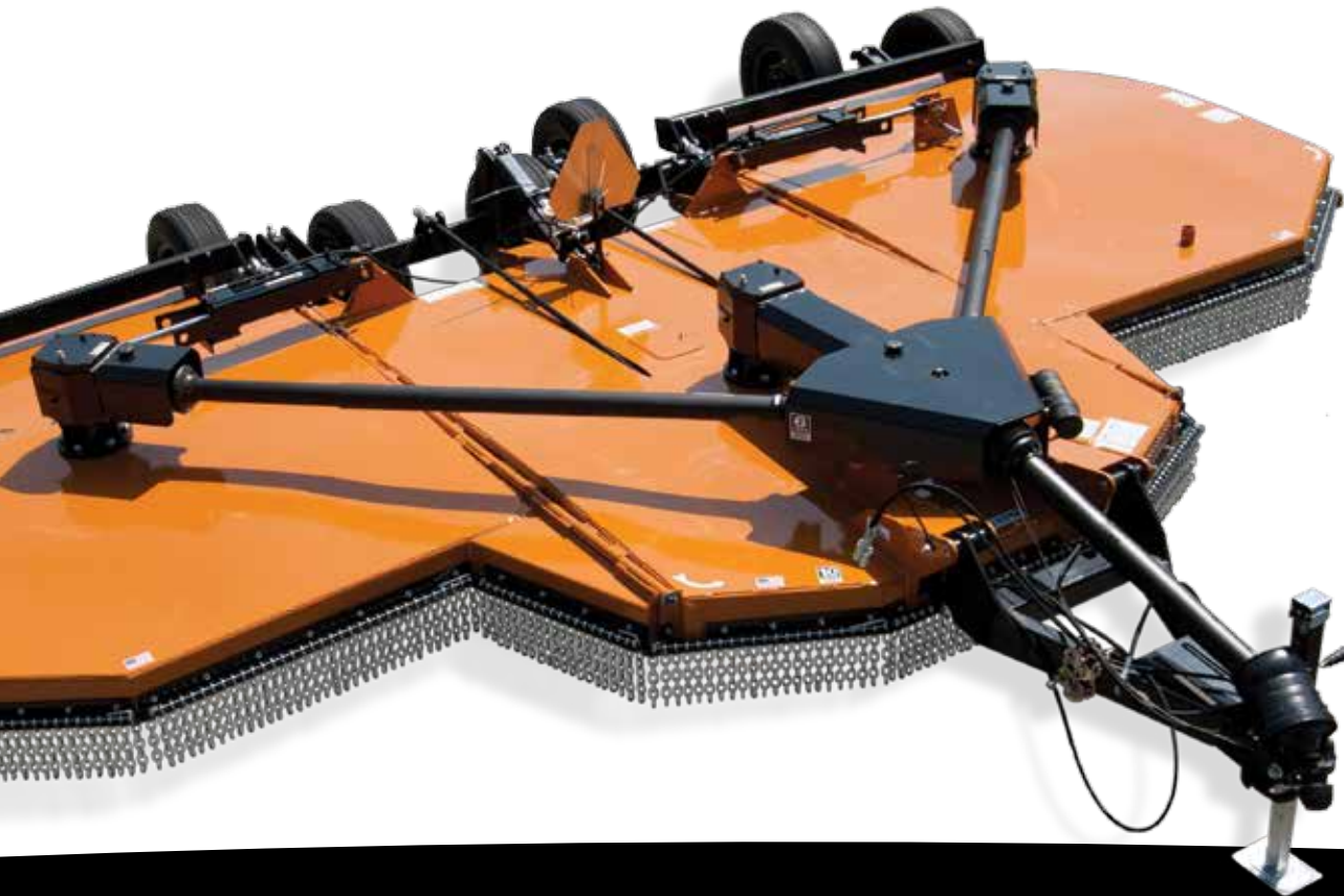
BW240HD shown with standard chain shielding*

*NOTE: Woods Batwing® models pass all applicable safety standards for thrown object and blade contact without chain shielding. However, if these units will be used in areas where the possibility of thrown objects could be hazardous to persons or property, it is strongly recommended that optional chain shielding be used for extra protection.